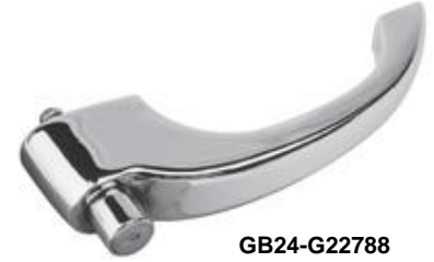
GB24-G22788 (High grip handle)