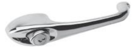
GB24-G07986 (Classic push-button handle)